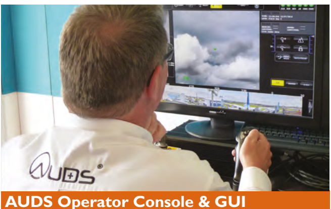
AODS Operator Console & GOT

The response of a UAS to RF inhibition is dependent upon its design and manufacture, including the programming of any auto-pilot function and the actions of the UAS operator.