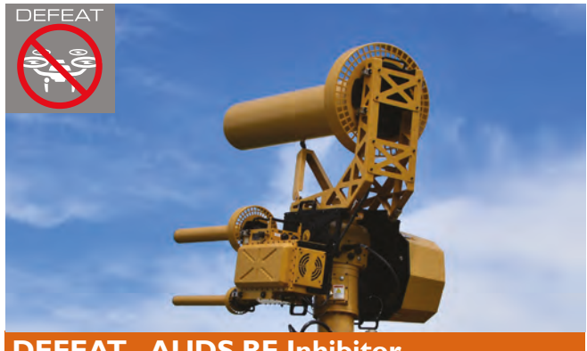
DEFEAT-AUDS RF Inhibitor

The AUDS RF Inhibitor is a purpose-designed multi-band system, engineered for maximum effectiveness against UAS command and control (C2) links. RF inhibition can be activated either selectively or simultaneously across the 400 MHz to 6 GHz spectrum, targeting five threat 'bands' which are designed to defeat the C2 links commonly deployed throughout the UAS threat landscape (i.e. 433 MHz, 915 MHz, 2.4 GHz, 5.8 GHz and GNSS bands).